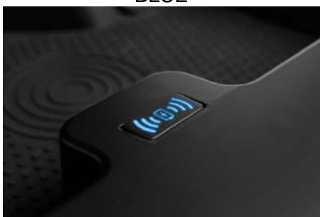
Ready to charge