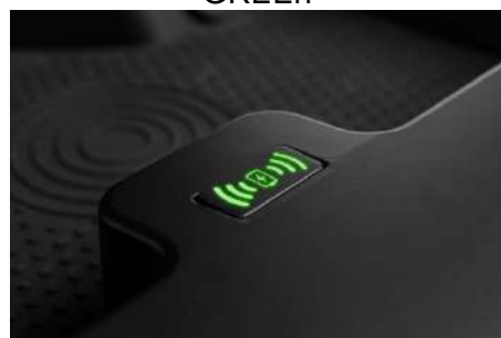
Unit is charging